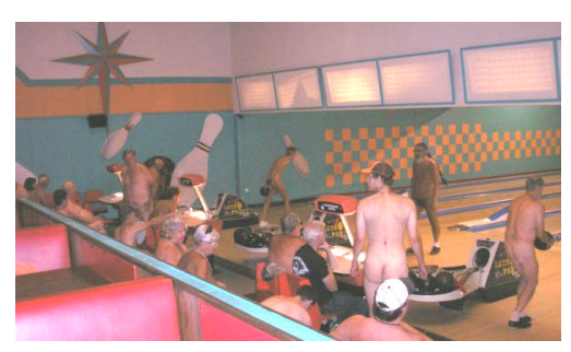
THIS EVENT STARTS ON TIME AND WE MUST BE OUT BY 5:20 AT THE LATEST!